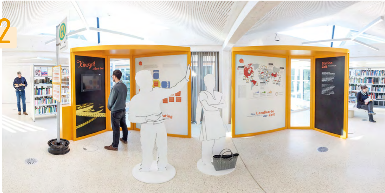
Learning station »Time« on the upper floor of House 2