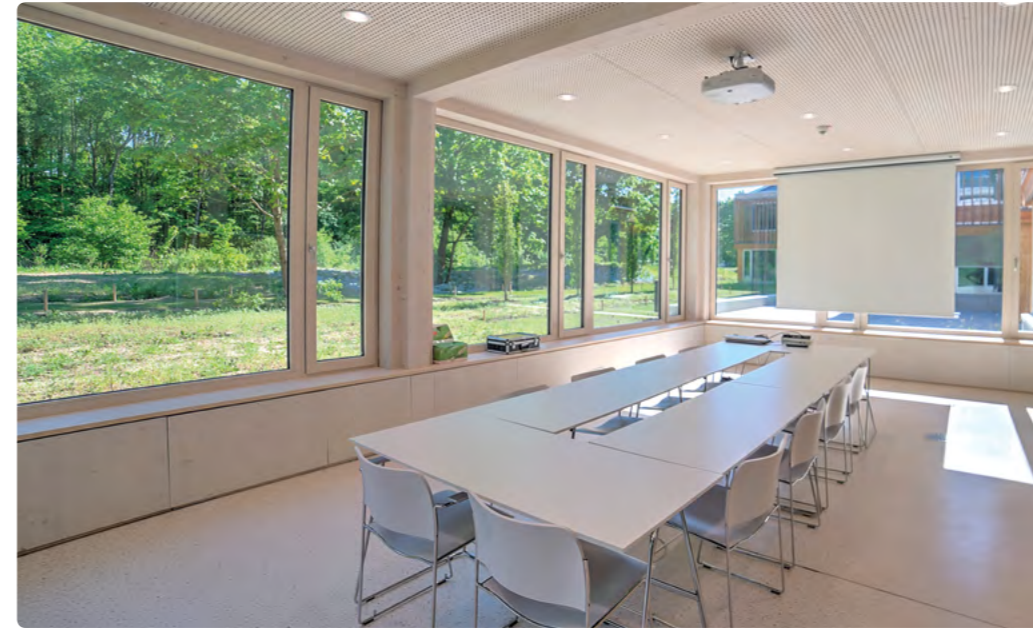
^ Light-flooded training rooms for inspired learning

Learning worldwide: At our regional training hubs in Bangkok, Addis Abeba, Bogotá and Dakar