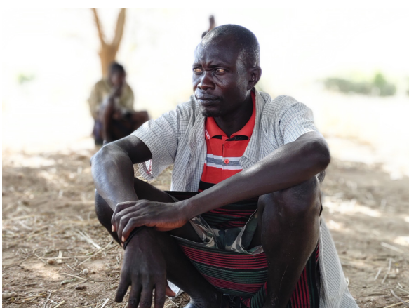
Photos (left): Focus Group Discussion, Women, Livelihood study Turkana Central, Kenya (February 2022).