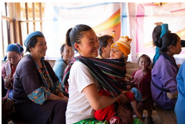
CEGGA-supported CSO engagement in Xiengkhuang

CEGGA supports a group of CSOs in a joint project addressing immediate needs of local communities.