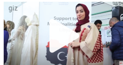
Video: Libyan women at the InterTEX Tunisia

» For more on this project, see GIZ's Integrated Company Report