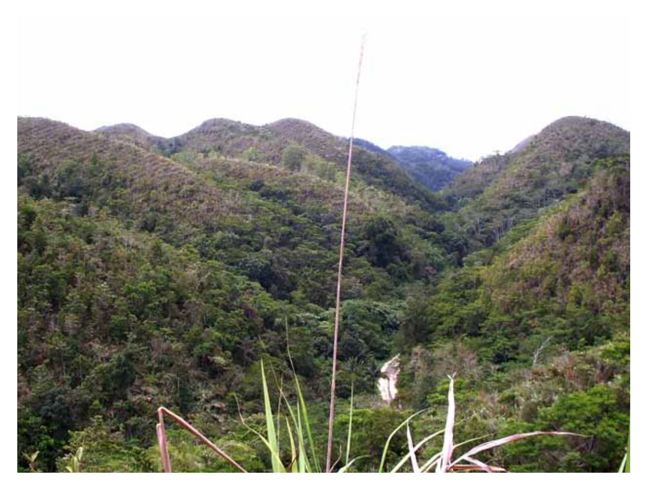
Pursuing an Enabling Policy Climate for REDD-Plus Implementation in the Philippines: Review and Analysis of Forest Policy Relating to REDD-Plus

As previously discussed, the definition of forests that the Philippine government adopted from the FAO can potentially include plantations that are not trees and dilute efforts to restore degraded areas.