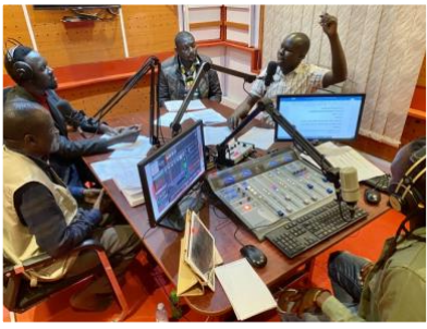
'Land Matters' radio talk show. CPS is strengthening peace-building efforts through conflict-sensitive media