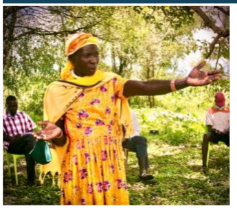
A dialogue meeting with Elders. Cultural leaders are important partners in the peace-building process.