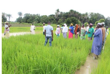
Photo right: Training of service providers in agricultural mechanisation, Hauts-Bassins, Houet (Matourkou).

Photo left: Guided tour of a rice production demonstration plot using organic manure. Sud-Ouest, Ioba (Oronkua).