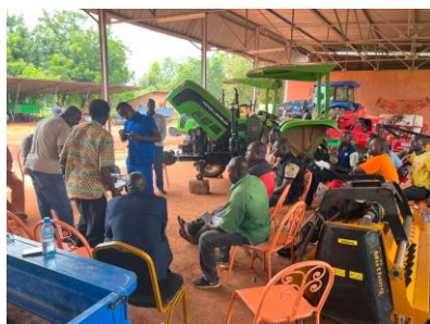
Photo left: Guided tour of a rice production demonstration plot using organic manure. Sud-Ouest, Ioba (Oronkua).