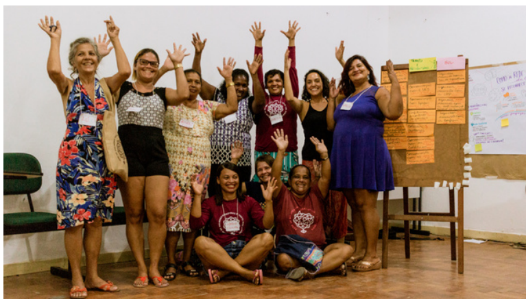
Coral Coast Fisherwomen's Network Seminar 2019, Tamandaré (PE)

In 2018, while attending a seminar on artisanal fishing organized by the Project TerraMar (IKI/GIZ), these women decided to change their destiny. Even though most of the participants were men, the women joined and engaged in group discussions. They soon built a bond and rapport and asked TerraMar to support their journey. That is where the story of the Coral Coast Fisherwomen's Network began.