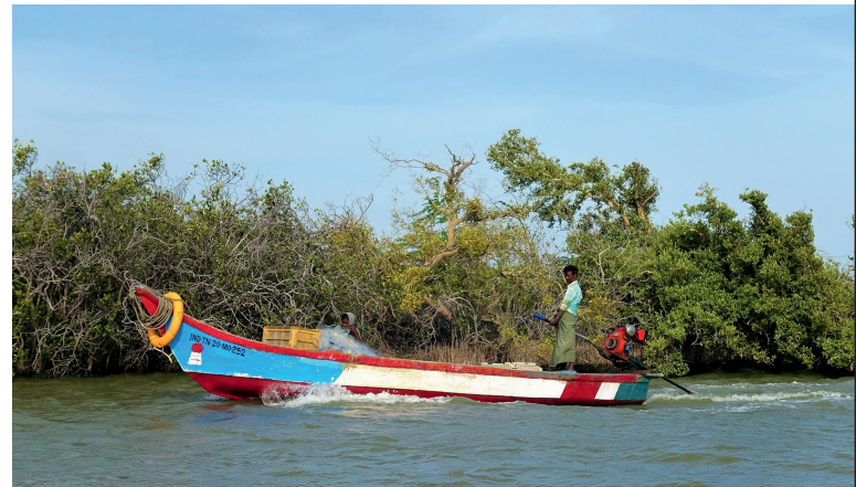
Managing wetlands for biodiversity and climate action in Tamil Nadu, India

Major causes of the continuing loss of biodiversity are the over-exploitation of natural resources, environmental pollution on land and in the oceans, the displacement of endemic animals and plants by invasive species, and climate change. In order to halt the loss of biodiversity, a transformative change is needed.