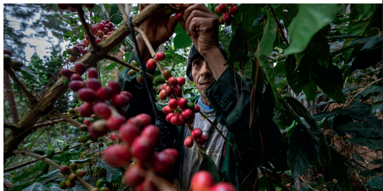
Growing organic coffee in Peru