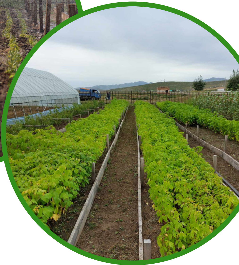
Tree nursery in Javkhlant soum: 13 September 2023