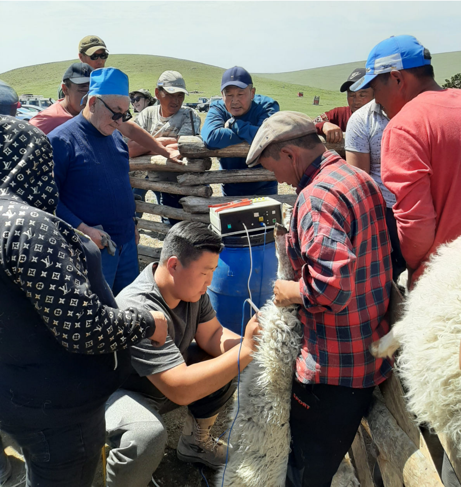
Practical application of the electrocautery castration technology on lambs

In addition, training on the practical application of electrocautery castration techniques was organized with the involvement of local livestock experts and herders. These techniques were used on over 50 young cattle and 480 lambs to enhance growth, ensuring early economic turnover. For more