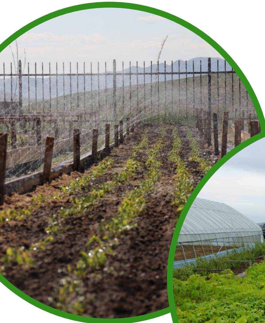
Tree nursery in Javkhlant soum: 7 June 2023

Within this nursery, we have carefully nurtured a different selection of trees (16,000 pieces in total), featuring three sections of maple trees, another three dedicated to elm trees, and singular sections for Siberian apricot, long-peduncled almond, and the Siberian pea shrub. Together with the Soum Governor's Office, we ensure that the nursery remains in prime condition, with regular weeding and irrigation practices in place to support the growth and vitality of these plants.