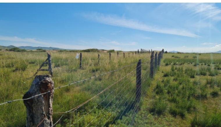
Demonstration plot in Javkhlant soum: 24 August 2023