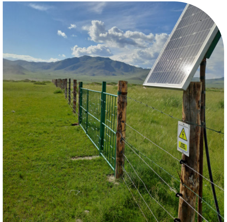
Fenced area of agroforestry pilot demonstration: before and after construction of the electric fence