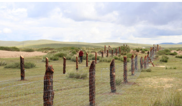
Demonstration plot in Javkhlant soum: 21 August 2022 (fence just established)