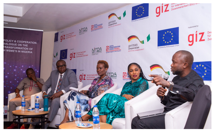
1st policy dialogue: Digital transformation of non-tech MSMEs in Nigeria