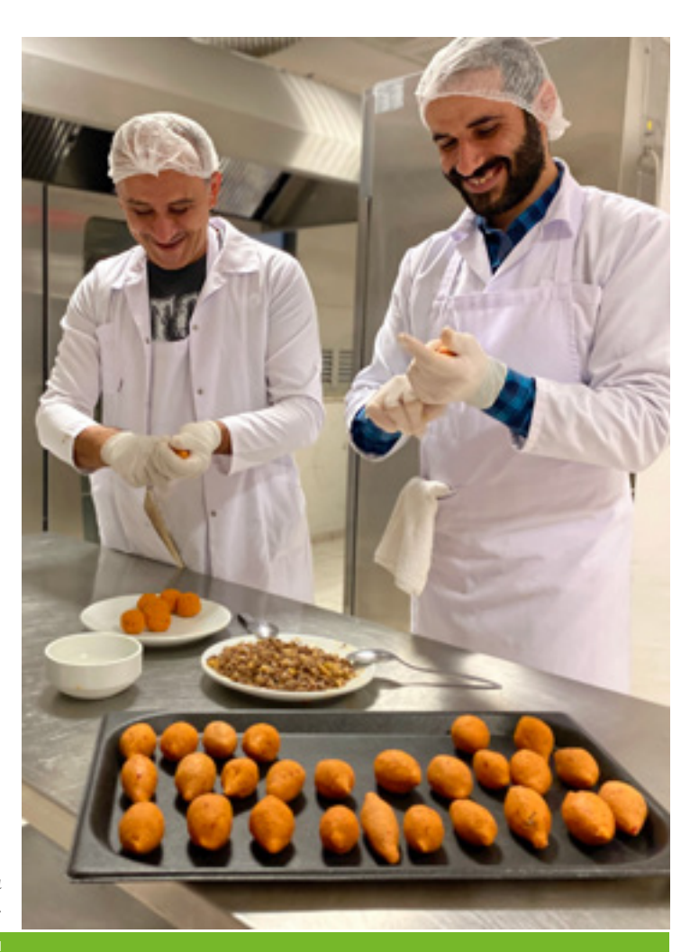
Participants learning new skills in a Turkish Gastronomy class in Istanbul.

The project bolstered the socio-economic resilience of refugees and the host community in Türkiye by matching their skills with market needs, equipping them with the needed skillset for improved employability. It also fortified MSMEs and enhanced partner competencies in providing customised business support services, thereby stimulating job demand and invigorating the overall private sector dynamics. The integration of Syrian refugees into Türkiye's economy advanced their self-reliance, reduced aid dependency, and provided stable incomes, especially post-earthquake. This approach promoted social inclusion and cooperation, enhancing community fabric and shared prosperity.