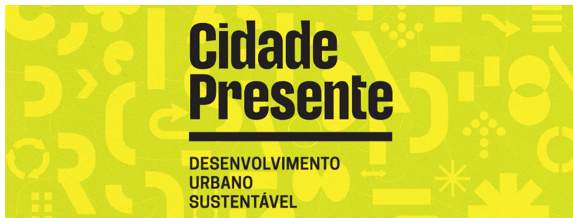
Image: logo and visual identity of the Sustainable Urban Development (DUS) project.

aims to promote good governance, contributing to social cohesion.