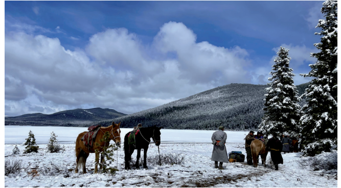
Rangers of the Khan Khentii Special Protected Area

Together with the Mongolian Ministry of Environment and Tourism, the project strengthens the legal framework for protected areas. While SPACES I supported the reform of the national protected area law, the innovations introduced into the law must now be substantiated by detailed national as well as protected area specific regulations. This will enable more efficient protected area management by, for example, strengthening approaches of co-management and self-financing.