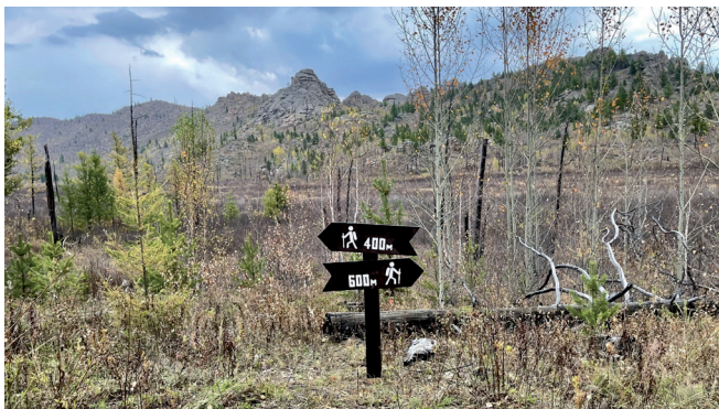
Nature trail established at Khan Khentii Special Protected Area with the support of the GIZ