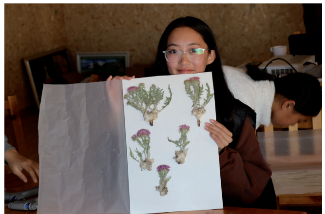
Participant of a workshop on Environmental Education and Communication for eco-clubs of secondary schools from Khovd Aimag

Approaches strengthen to environmental education and communication (EEC) are tested in protected areas to enable their national replication in the future. The project advises staff of the protected area administrations on EEC matters and develops respective training programmes for rangers. At the same time EEC programmes for children and youth are created. All this work will mobilise support for the implementation of the new protected area law, increase the acceptance of protected areas among the population and thus also reduce the pressure on protected areas.