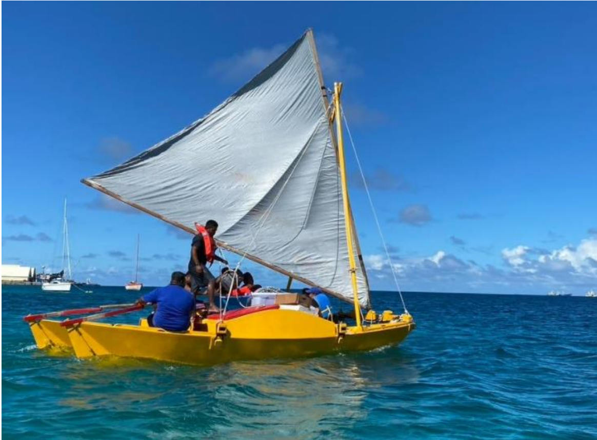
The WAM (Canoes of the Marshall Islands) Catamaran Design in usage during sea trialing in the Majuro Atoll lagoon.