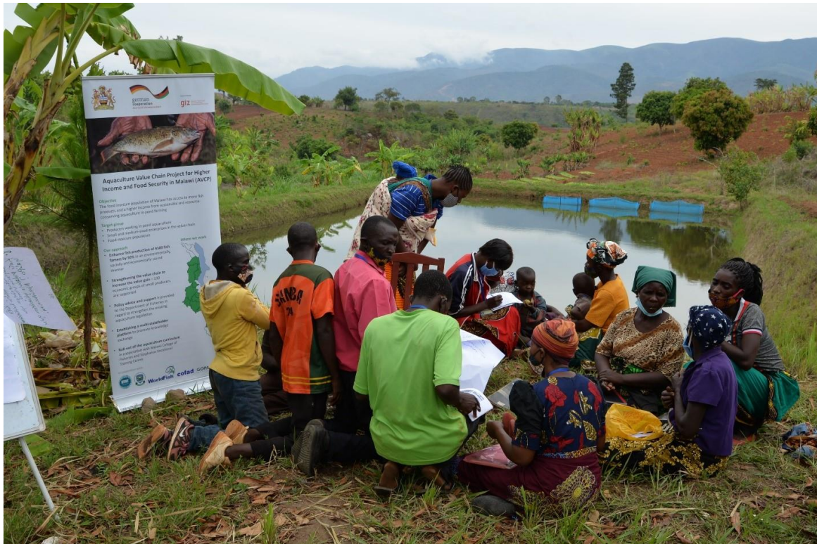
Mdimwa Fish Farmer Group drafting a constitution in Rumphi district, Northern Malawi