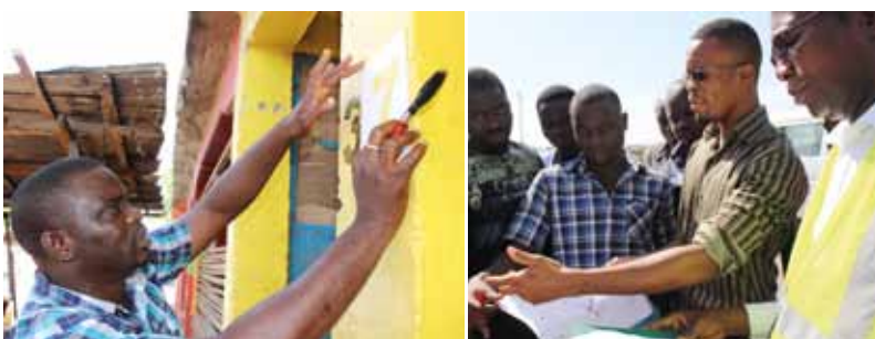
Fieldwork to implement the Street Naming and Property Addressing and finally to establish a fiscal cadastre in Wa

SfDR builds upon the developed and proven instruments from the previous phases and focuses on broader dissemination, up-scaling and improved implementation to consolidate progress that has been made so far. The programme continues working at the local level with its partner districts as well as at the national level with the MLGRD and other relevant stakeholders. In addition, the programme focuses on the regional level to strengthen its crucial role in Ghana's decentralisation process.