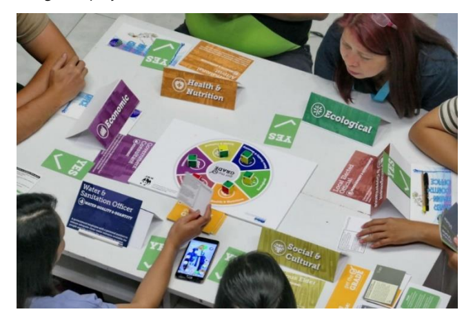
A role-playing game that allows river basin stakeholders to understand the multiple factors which influence a basin's overall health and apprechiate collaboration during decision-making.

E2RB builds on the achievements and partnerships created during the implementation of previous and ongoing projects implemented by GIZ, USAID and Earth Security Partnerships in the Philippines as well as projects in neighbouring countries and GIZ global projects.