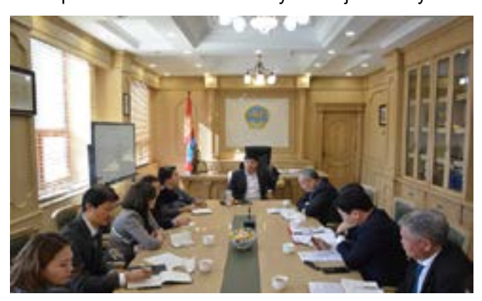
Mr. Kh. Nyambaatar, Minister of Justice and Home Affairs welcomes the working group to set up a training center for judicial clerks

Better qualified staff and greater technical competence at the courts, plus the creation of a stable legal framework form the basis for an efficient judiciary. However, the Mongolian Government does not have sufficient resources necessary to provide the above. Given the challenge described above, despite the progress already accomplished in implementing legal and judicial reforms there is still room for improvement in the performance and efficiency of the judicial system.