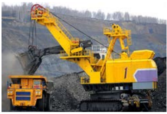
Cooperation in mining law