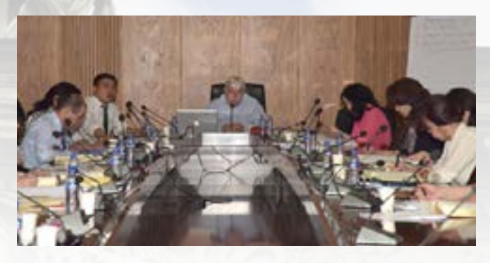
Training of Trainers for the judges training