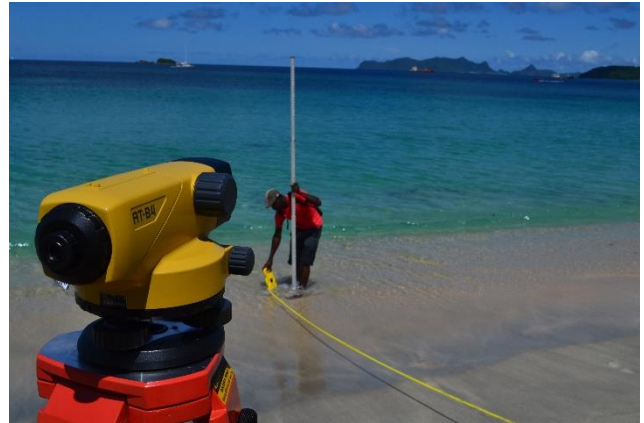
New equipment being used to conduct beach profiling in Carriacou

Beach profiling workshops were held in January 2016 to train stakeholders on how to properly profile and monitor the beaches around the country. Equipment was procured and handed over to the various Government divisions in order for this data to be continually collected. Priority beaches have been selected for regular monitoring and beach monuments have been established on these beaches.