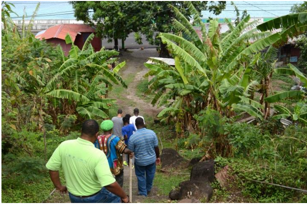
Members of the Task Force surveying the coastal area

A coastal zone task force has been established and is comprised of representatives from various government divisions, statutory bodies and civil society which share responsibility in the management of the coastal zone. This task force was instrumental in reviewing the policy and in the designation of the coastal zone management area. The task force meets monthly and their duties also include assisting with the development of EIAs for coastal development and supporting the Environment Division with coastal issues. In the absence of a dedicated coastal zone unit, the multi-stakeholder task force is foreseen to be the nexus for integrated coastal zone management in Grenada.