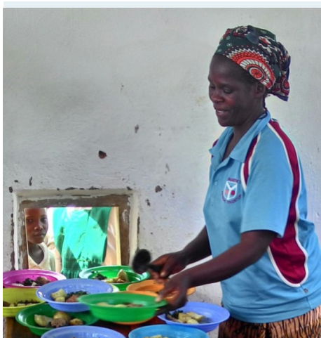
Healthy home grown school meals distribution: The approach aims at providing high quality meals and nutrition education.

locally procured. The approach has opened up a new school of thought bringing a focus on nutrition as a whole. These lessons are not only enclosed on the school grounds, but are further migrating to the households of the learners and parents, who are the community volunteers tasked with menu production as well as preparation and serving of these meals to learners. Based on community contribution and ownership, the approach is a vehicle for a mindset change for households to practice the skills gained in their own homes. It needs to be mentioned that nutrition