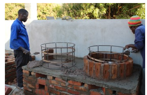
Double stove under construction at Jalo school, Nkhotakota.

Food is cooked in 70 litre and 150 litre steel pots for relish and nsima respectively, which can easily be lifted out of their cages and cleaned. The stoves take 2-3 days to build and are designed in an environmentally friendly manner so that the less firewood used, the bigger the fire and heat circulation in the fire chamber, speeding up the cooking time. Upon completion, School Feeding Committees are trained on how to use the stoves correctly by stove builders. They learn how to