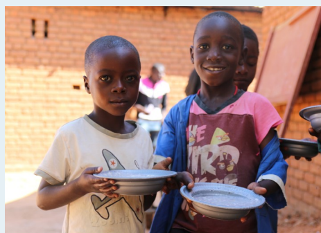
Learners at Isyalikira school, Chitipa, receive porridge.