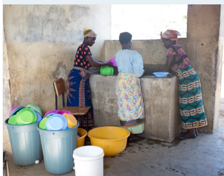
Community members clean plates after school feeding. The voluntary work of community members is core of the HGSM approach.