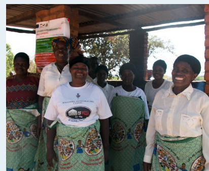
One of the cooks teams at Isyalikira school, Chitipa. Thanks to their voluntary work learners receive a school meal every day.