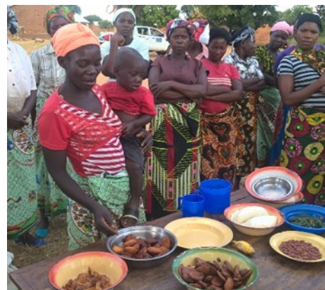
Participants explaining the dishes.

began: The participants provided local products such as cassava, sweet potatoes and indigenous vegetables. The facilitation team brought other ingredients like salt, oil, oranges, plantains, tomatoes, onions and meat. Teams of three to four participants each got a few recipes to prepare. They were excited to learn new methods and meals, e.g. more nutritious meals for the kids or the famous one pot meals with at least three food groups. Particularly the women showed their skills and turned local foods to delicious dishes.