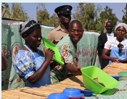
Members of the Cooks Team at Vulundiya primary school, Mzimba South, present nutritious meals.