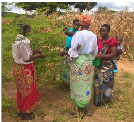
Participants harvesting Moringa leaves for cooking.

In the end, participants presented their dishes e.g. soya milk, cassava-usipa-vegetables (bonongwe/ chisoso/ nkhwani), cassava-beans, sweet potato-beef-vegetables, green banana-futali, nkhowe-groundnuts, different snacks and many more. Of course, afterwards all participants enjoyed eating the dishes together. Through these trainings, Afikepo/NAPE builds the school cooks' capacity to prepare simple but nutritious meals for learners. By using locally available foods, it is ensured that recipes can be replicated at school and at home. ■