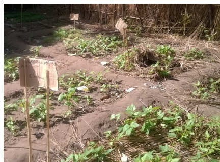
Good practice school garden: Every school garden club member is responsible for one bed.

On top of that, the school has a vibrant school garden with many different vegetables such as pumpkins, cow peas, okra, beans and mustard. To keep the garden up and running, each vegetable bed is allocated to one student who is responsible for it. Knowledge about the gardening activities is actively shared among all teachers and learners. After hearing about Wozi and Mavungwe schools in Mzimba South that have replicated school