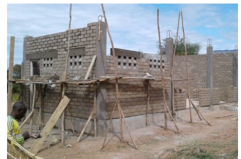
Construction works underway at Lwezga school, Karonga.

Building this infrastructure at schools is important to store and cook healthy foods for the learners. By using adequate storage facilities, food loss can be reduced. The kitchen facilities with the institutional cooking stoves will enable the cooks to prepare meals in an energy-efficient way. As a result, schools will need less firewood and less harmful emissions will be produced.■