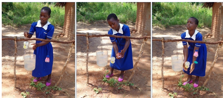
A learner demonstrates how to use a handwashing station which was locally made from plastic bottles and are easy to replicate at home.

Today hygiene practices have improved at the school and good sanitation is being observed and prioritized at the school. With the help from the School Management Committee the school could maintain the latrines and urinals, construct permanent handwashing stands and procure the hand washing facilities through the school improvement plan as well as digging rubbish pits around the school, and find locally available resources to make drop hole covers. The learners are also able to use the latrines properly and wash hands with soap. For effective behavior change, the learners are encouraged to share the messages with their families at home demonstrating that SHC can serve as a vehicle of change. ■