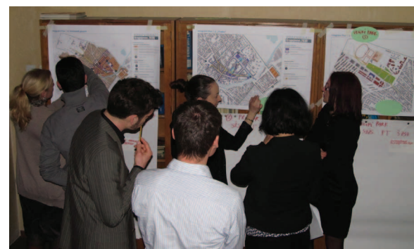
Integrated Urban Development Concept: Different areas for intervention in the inner city of Kragujevac

The city of Kragujevac is a regional centre for trade, services and culture. The absence of investments in the last decades become apparent from the deterioration of public and private buildings, underutilized areas within the inner city, as well as missing infrastructure facilities. Through the development of an integrated urban development strategy, local potentials for future development have been identified and strengthened in order to revitalize the inner city area and open it up for potential investments and new developments.