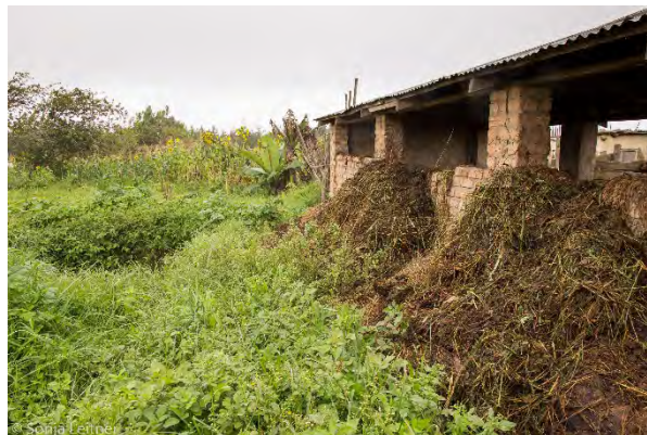
Figure 6: Manure burned as fuel. Here manure is collected from a barn and dung cakes are formed by hand, then left in the sun to dry. In other regions, manure deposited by grazing animals is left on the pasture to dry and then is collected later. Dried manure is often stacked for storage before it is used as fuel for cooking or baking.