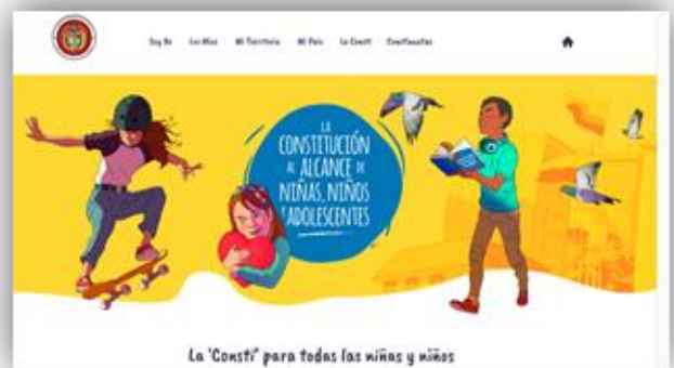
Photo: Internet page 'The Constitution for children and young people'

In the Constitutional Court project 'The Constitution for children and young people', GIZ is supporting creation of a special page on the Constitutional Court website for a young audience, which will be made accessible to the public in the first half of 2022.