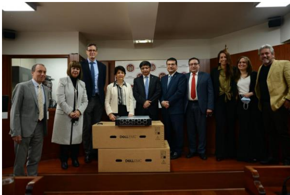
Photo: Donation of IT equipment, Bogotá 2022

On 4 March 2022 the Court was given a server together with licences and backup hard drives worth COP 450 million (around EUR 100,000) for the electronic search of the rulings of the Constitutional Court. This technical equipment will prevent loss of data on the stored decisions (currently 37,000) and increase the speed of the search