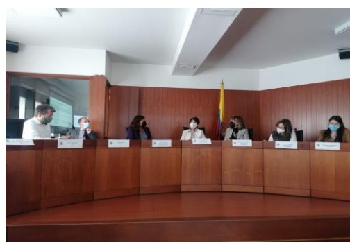
Photo: Courtroom, Constitutional Court, Bogotá, 2021

The project aims to supplement the Constitutional Court's existing initiatives to modernise its organisation and find joint solutions for the impending problems.