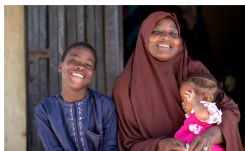
Children beneficiaries enjoy clean water at Lokuwa 1 Primary School, Lokuwa (left) and Mother and Child beneficiaries of Education project, Auno (right).