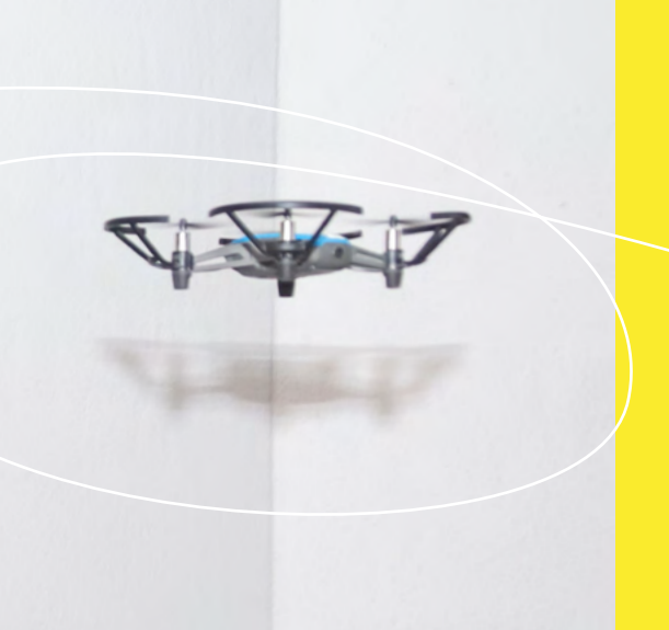
Drone Divas is a women-only drone training programme that empowers young women from townships to become successful in South Africa's male-dominated drone industry.