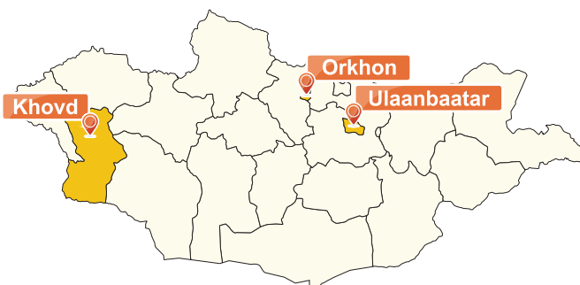
Ulaanbaatar, Orkhon, Khovd