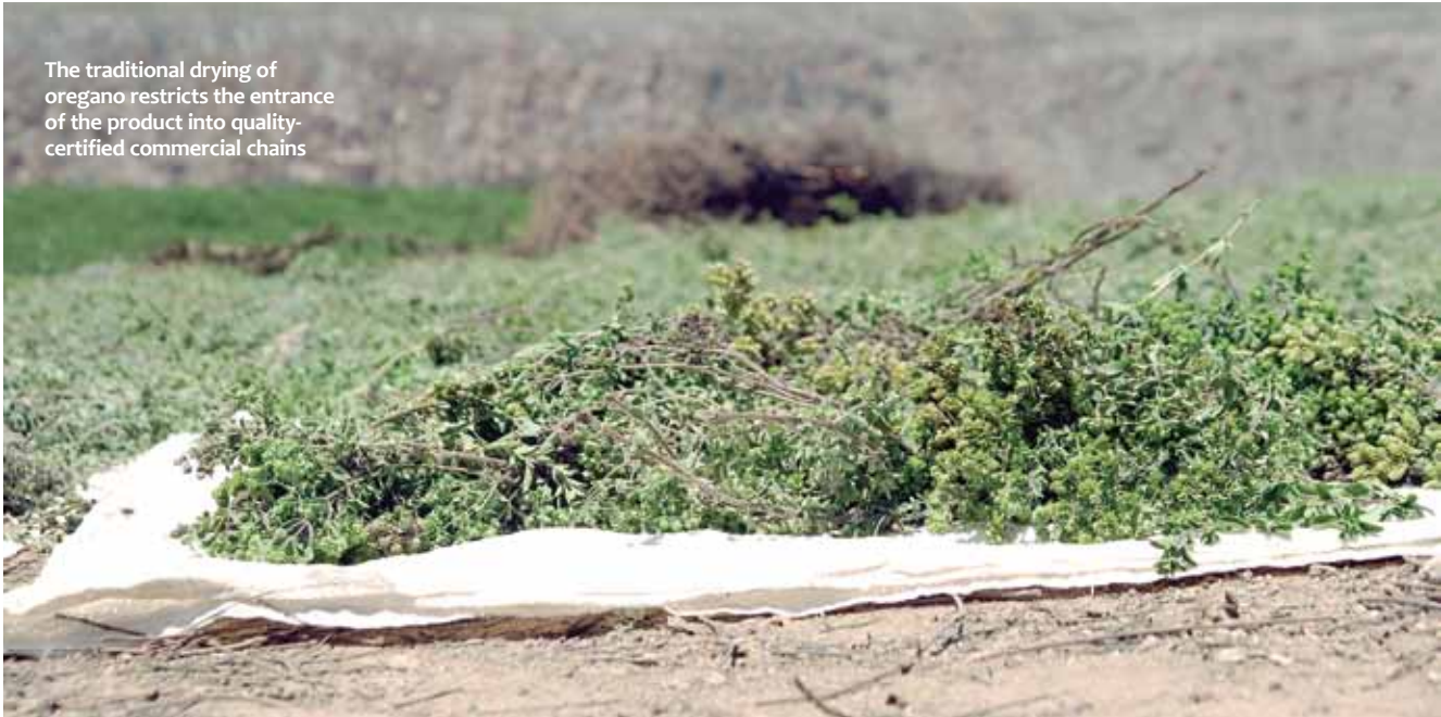
The traditional drying of oregano restricts the entrance of the product into quality-certified commercial chains

The Callazas Association of Producers of Oregano and Aromatic Plants has existed for more than eight years and is located at 3,800 meters above sea level (12,467 ft). The plantation of oregano is one of its principal sources of income and they are currently looking to accede to the AGROIDEAS program.