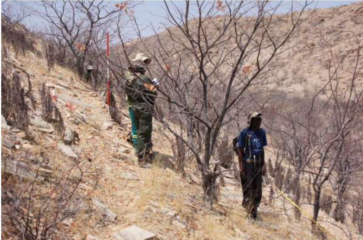
Inventory team working in Mopane woodland in Namibia.

forest appeared larger on images from 2010 (14,392 km 2 ) than on images from 2000 (12,042 km 2 ) that showed more degraded areas than images from 1990 (7,894 km 2 ). Nevertheless, the rate of degradation slowed down in the second decade. In relationship to the area of intact forest land in 1990, the annual gross degradation rate was 3,13% during the first decade and rose marginally to 3,43% in the second decade. Degradation has a substantially greater impact on the forest at the test site than deforestation, which calls for further investigation into the drivers of degradation.