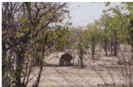
Mopane trees providing shadow to a lion.

Forest to Settlement: 26 ha/year, 591 tonnes CO 2 /year