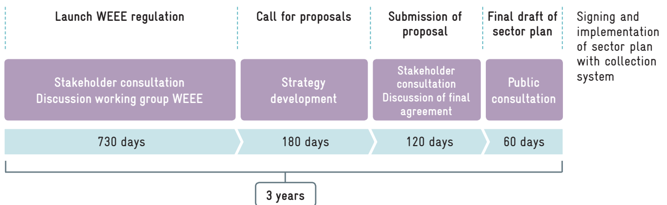
Figure 4: Expected timeline from launching a WEEE regulation to implementation of a WEEE collection scheme.

The sector plan must contain a realistic and binding timeframe. Note that it may take several years from the moment a WEEE regulation has entered into force until the implementation of the collection systems (Figure 4). Although the actual timeline may strongly vary, at least three years should be allowed for. A continuous stakeholder process should take place and a public consultation process is advisable. The implementation depends on strict government supervision during the whole process.