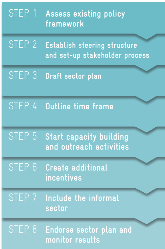
Figure 1: Overview of different steps for establishing a collection system for ODS containing equipment.

The guideline provides a step-by-step process for setting up a collection system.