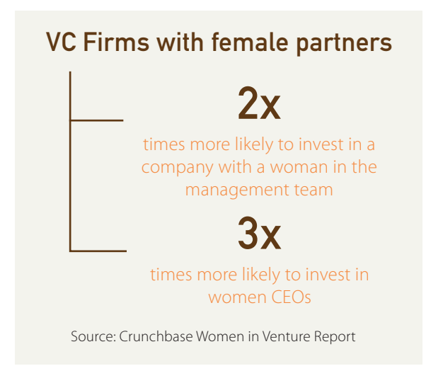
Figure 5: VC firms with female partners are more likely to invest in women

Acceleration in private wealth creation and its concentration among women points towards an opportunity to design and promote programs that engage with high net worth women and help them channelize their wealth into investments in women-