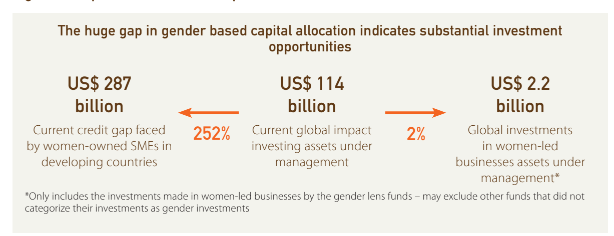
Figure 3: Gap in Gender Based Capital Allocation 18,19

The majority of women-led enterprises in India are subsistence businesses operating in the informal sector. Around 83% were without hired workers and only about 88% of the total 13.45 million persons employed in women-led establishments were employed in the establishments hiring less than 10 workers-pointing towards an overwhelming concentration of micro and small businesses.<sup>20</sup>