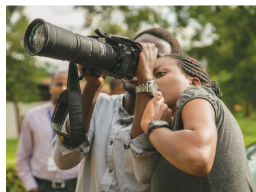
L to R: wood working business; Community-based tourism activities; Training on film production.

A specific focus is placed on the economic empowerment of women, youth and persons with disabilities. For example, Eco-Emploi supports the National Council of Persons with Disabilities in developing a Disability Management Information System that identifies the barriers, needs and potentials of persons with disabilities to facilitate their integration into the labour market.