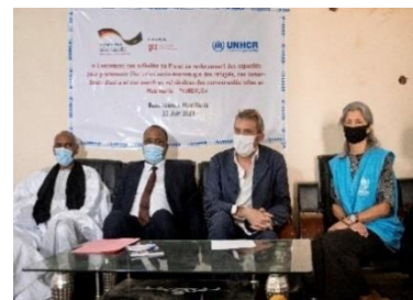
Launch of the ProNexus with the local authorities in Bassikounou on World Refugee Day by the Head of GIZ in Mauritania and the UNHCR

To ensure joint implementation and cross-organizational linking and learning, as well as sharing of good practices , staff from GIZ recruited for the project recently joined the UNHCR sub-office in the field and are working hand in hand with their UNHCR peers, being fully integrated in the relevant functional units (protection and livelihoods).