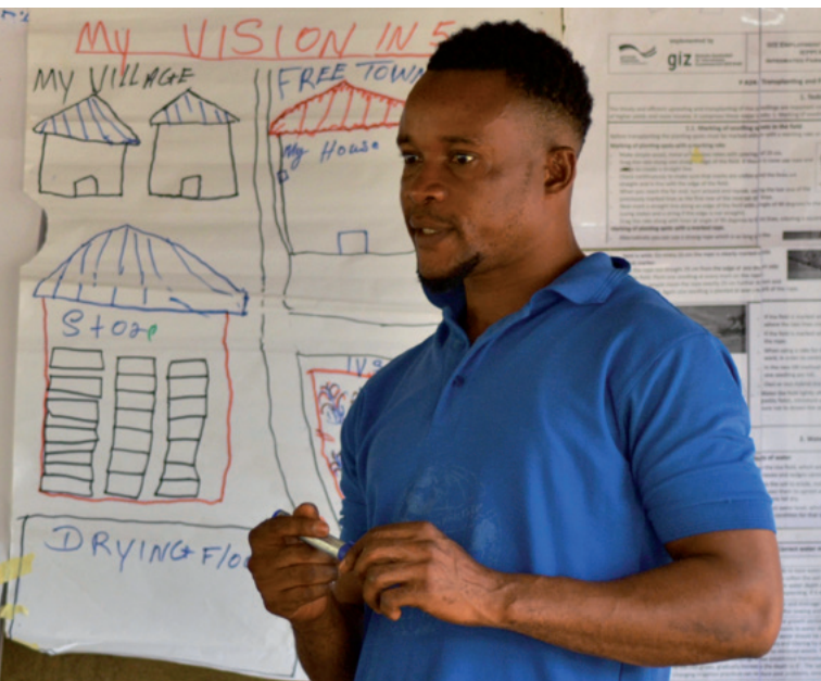
Facilitator conducting the IFT in Soa Chiefdom, Kono District