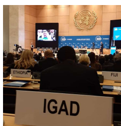
Photos (left): German cooperation staff and IGAD at 2 nd IGAD Scientific Conference on migration and displacement in the context of COVID-19 (February 2021).