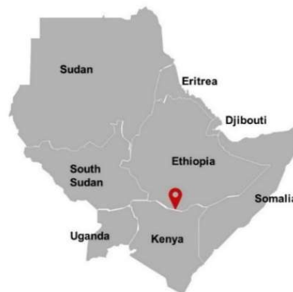
Graph 1: The border region Moyale-Moyale at the Ethiopian-Kenyan border is located on the main migration route to the South.