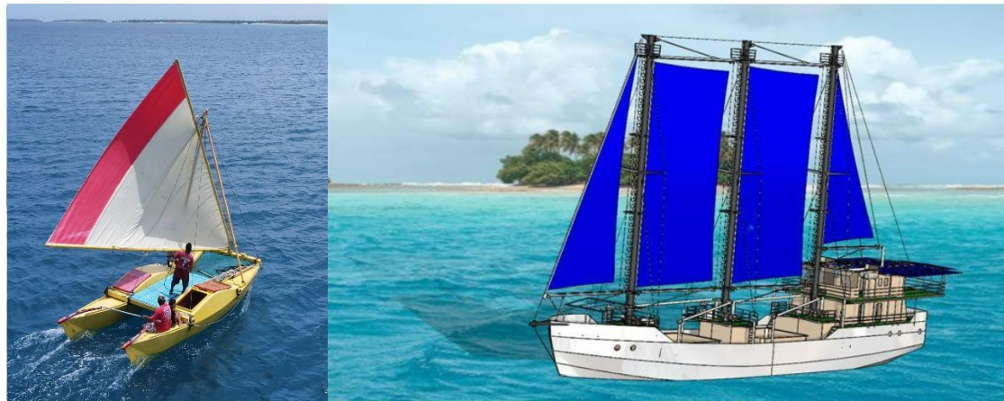
Left: Prototype Catamaran Type "WAM" from the Boatbuilding Program 2020 (WAM-Canoes of the Marshall Islands) Photo @Raffael Held. Right: Preliminary 50m sailing cargo ship design Photo @University of Applied Sciences Emden Leer

The project introduces a wide range of climate-friendly solutions. One of these is developing and pilot-testing low-carbon propulsion technologies in cooperation with partners. Other steps are educating and training ship crews and researchers, as well as using modern energy-efficient sailing technologies and renewable energy. The project takes a two-phase approach. First, it works with partners to assess the fleet's economic efficiency and emissions. The baseline data from this are to be used to develop and analyse various low-carbon propulsion technologies for all shipping needs.