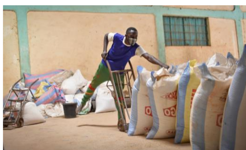
Cocoa farmers during cocoa fruit harvest; youth male during work in the agricultural sector.