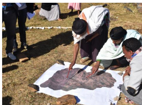
Community representatives participating in awareness raising and participatory rural appraisal (PRA) activities