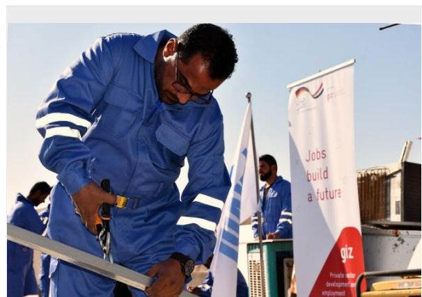
Training on Drywalls in Basra, May 2019

The project improves employment prospects in the private sector for young Iraqis, especially women and returnees, following an integrated approach that combines labour market-driven skills development and job placement measures as well as entrepreneurship development, and advisory services for MSMEs. The project supports local education providers, businesses, and civil society groups in providing new (self-)employment and business opportunities to give them a perspective.