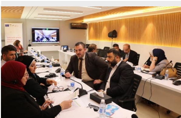
Training on Business Integrity, Baghdad, May 2022

To support the Government of Iraq and to create opportunities for the Iraqi people, the Private Sector Development & Employment Promotion (PSD) Project has been commissioned by the German Federal Ministry for Economic Cooperation and Development (BMZ) and co-funded by the European Union (EU). This project is implemented by the Deutsche Gesellschaft für Internationale Zusammenarbeit (GIZ) and relies on a multi-level approach that interlinks policy / network level with institutional development of key partners and capacity development. Enabling vulnerable groups such as women and returnees is an imperative to our work. Furthermore, special attention is given to sectors with a strong potential for growth such as agribusiness, solar energy, waste management, and hospitality, with a regional focus on Baghdad, Basra, Diwaniyah, Diyala, Erbil and Mosul. The PSD project works on two main aspects: