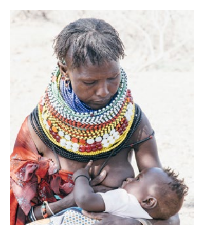
A mother breastfeeding with correct positioning and attachement

<u>Reason:</u> Women organized in groups are more likely to receive MIYCN trainings and to regularly follow the course. The members can exchange knowledge with each other.