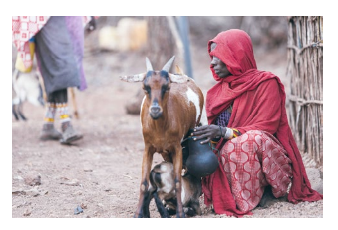
Milking for the family

1. Determine the good number of milking animals to keep near-by. Husband and wife