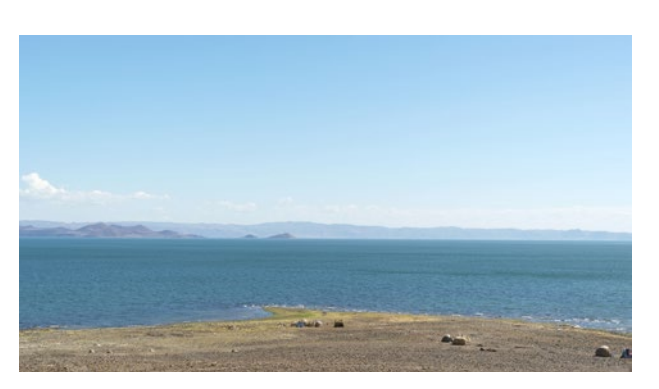
View of Lake Turkana

Kenya's landscape consists of almost 80 percent drylands – the "Arid and Semi-Arid Lands" (ASAL). They are home to roughly 30 percent of Kenyans, to three quarters of the country's domestic ruminants and to most of its famous wildlife. Marsabit and Turkana are the two biggest counties in Kenya and entirely located in the ASAL. The climate in both counties is predominantly hot with low average rainfalls during two rainy seasons – the short rains, usually from October to December and the long rains, usually from March to May. However, since several years rainfalls are becoming increasingly erratic. Years with extreme weather are more frequent than in the past, fluctuating between widespread, devastating droughts and, albeit less frequently, localized floods. Marsabit and Turkana counties share most of Lake Turkana, the world's largest permanent alkaline lake that is a hotspot for migratory birds and rich in a variety of fish species that are increasingly exploited. Marsabit has no permanent surface of fresh