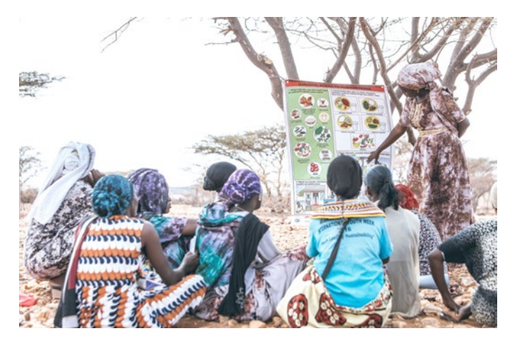
CHA, trained MIYCN trainer

base of all MSP members in nutrition and nutrition-sensitive approaches may increase the effectiveness of the MSP as well as facilitate the adoption of nutrition-sensitive approaches in the relevant sector departments at all stages (policy/strategy, planning, implementation) and thereby contribute to considering the whole food chain at county level.