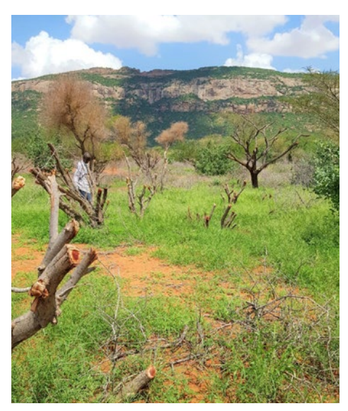
Grasses growing on re-seeded and protected area. Acacia reficiens cleared

7. Demarcation, removal of invasive species, soil work, targeted reseeding. The grazing areas that the community has selected for improved management need to be completely demarcated (e.g. red paint on trees, rocks etc.). In the strongly degraded parts, the removal of noxious and/ or invasive species will reduce bush encroachment and create space for the natural regeneration of useful indigenous species. Targeted re-seeding of selected grass species