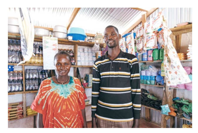
New business owners

<u>Reason:</u> For quality checks and reconciliation both books are needed. This facilitates the tracking of the loans by the SLG and others.