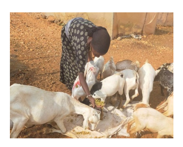
Fodder Supplementation, Pods of Acacia tortilis

crops. Proper sustenance of the milking animals near the homestead during the dry season Require improvement of both current husbandry practices and of the management of the natural vegetation and the water sources in the settlement area.