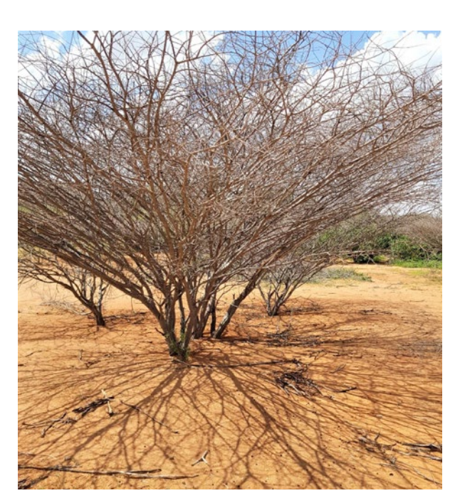
No grasses growing under Acacia reficiens, non-reseeded and non-protected area

may be necessary. To favor germination, manual soil scarification before seeding as well as protection of the reseeded areas with thorny branches of the removed trees has given appreciable results. On hillsides, semi-circular bunds have also given good results, provided that their diameter is no more than five meters, and provided that they are established in several rows over the slope in a manner that favors capturing a maximum of water for infiltration, while the excess water can spill over the entire slope. Capacities to