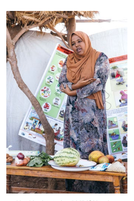
Nutritionist, trained MIYCN trainer

<u>Reason:</u> Basic information on the existing training capacity – both technical and methodological (adult education) – facilitates optimizing the trainings of MIYCN trainers (ToT).