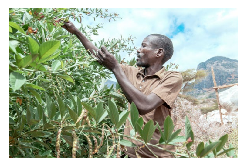
Harvesting Pigeon Peas

Pigeon pea: resilient, modest water and labour requirements; advantage: perennial, the tall variety is productive for up to three years, if well protected; may require five to six months for first production of seeds, then regular and frequent seeds production; grows tall and allows for planting smaller crops underneath (e.g. jute mallow) for optimal use of space