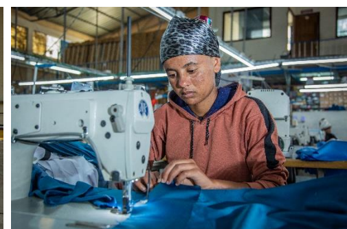
L. to r.: Refugees and Ethiopians participating in a food preparation training; Joint business group putting into practice their business idea at a newly established entrepreneurship centre at Ethiopia's first inclusive vocational college; Former vocational training graduate gaining in-company work experience