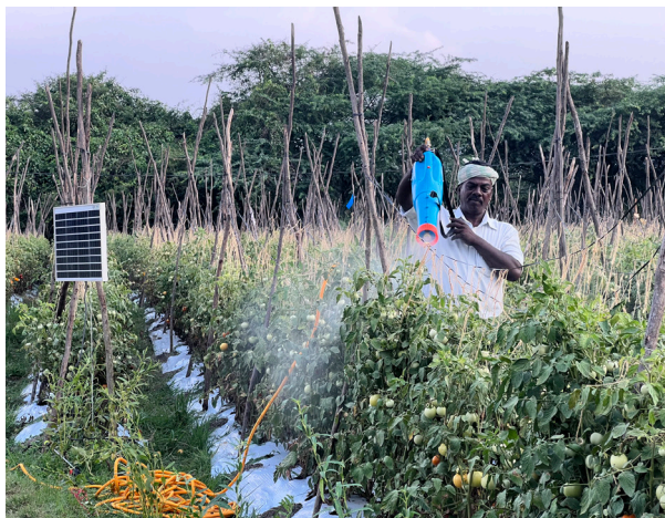
L. to r.: Solar Light for Livelihood Suyal Kuchi Solar Sprayer in Tomato Value Chain