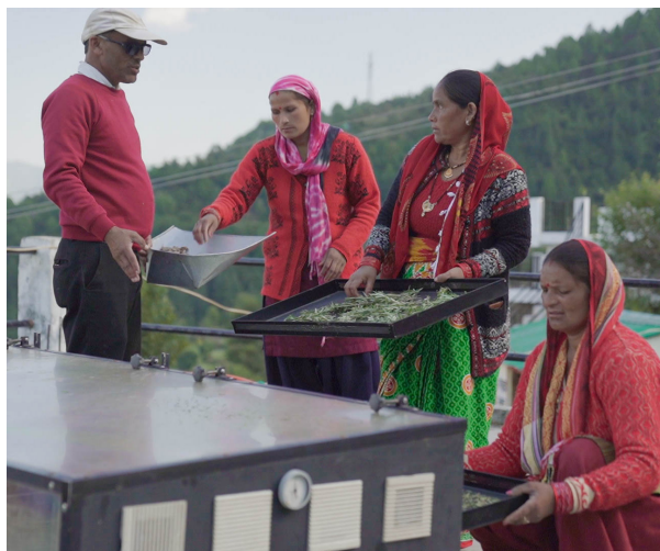
L. to r.: