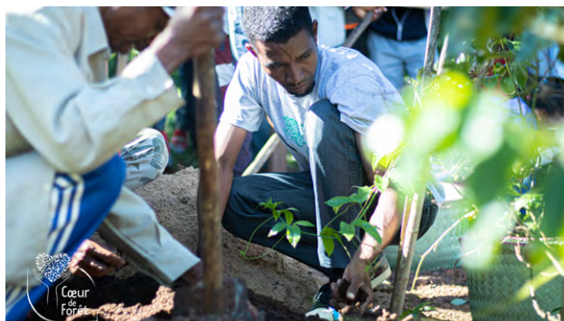
Men plant trees as part of a reforestation effort to reduce erosion during intense rainfall.

Adapted to the country specific contexts, different measures are being used for the GP Fish's intervention areas. However, the procedure is similar, starting with studying the individual effects of climate change to the region, piloting mitigation strategies to curb them and then imple-