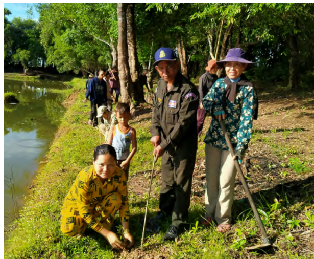
Community plants trees next to a pond to improve water retention and absorption in the soil.

Likewise, the intermittent harvest technique has proven to not only ease the adverse effects of losses during flooding events but has also shown that households have significantly increased their fish consumption (e.g., from once a month to twice a week) and cash flow outside of the harvesting season. Finally, the digital climate information system provides targeted weather updates and alerts on health risks, which are crucial for managing agricultural activities effectively amid the growing challenges of climate change.