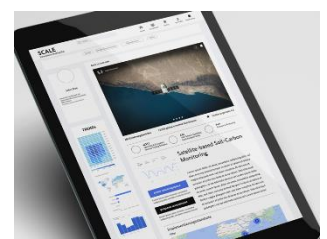
L.: Extension worker explaining an app enabling smallhold farmers to make informed decisions R.: Vision of the marketplace SCALE