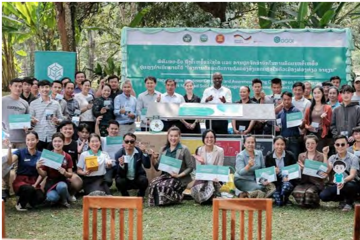
Participants celebrate recyclable waste bins

On February 09, 2024, the Global Green Growth Institute (GGGI) – as the implementing agency of AMUSE – held an official ceremony at Angle Cave in Vang Vieng district to distribute the first batch of Recyclable Waste Bins (35 units out of total 75 units) to the businesses in the tourism sector such as restaurants, guesthouses, hotels, as well as to schools and temples. These bins are specifically designed to facilitate the collection of recyclable waste generated by these establishments, with the ultimate goal of reducing landfill waste and promoting sustainable resource consumption.