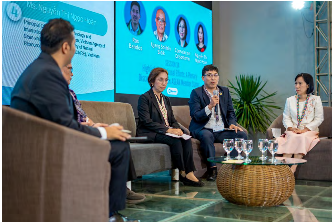
National ministries showcasing their efforts towards a sustainable waste management in ASEAN

Management Department of the Ministry of Environment of Cambodia highlighted the importance of bringing the knowledge down to the local level where most measures are implemented.