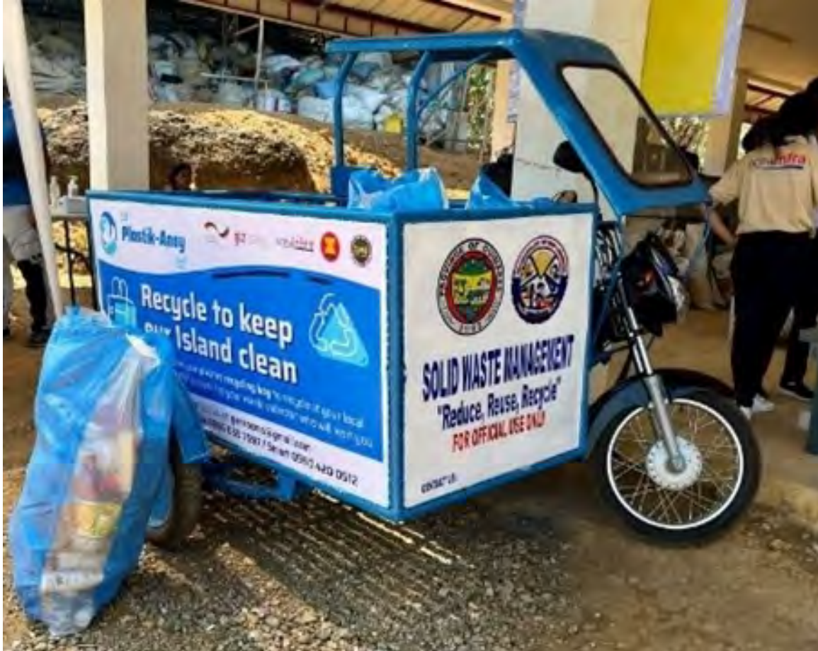
Motorized Tricycle for plastic collection in Guimaras

The plastic is collected monthly then stored in their local MRF until it is a truck load to be sent to Central Waste Management Facility in Sapa. The plastic will be processed into eco-lumbers for manufacturing fences, benches and tables and other furniture.