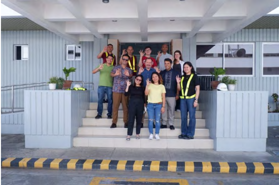
GIZ staff and site management of PETValue Philippines posing with the 3RproMar hand sign.