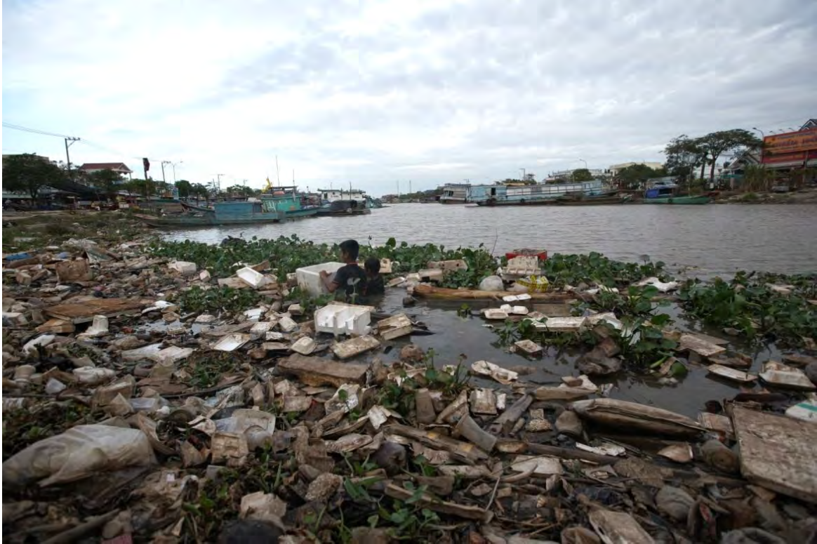
The audience filled the hall to join the discussion on EPR implementation and PPP for projects in the waste field.

Upon the approval of the project document by the Vice Minister of Ministry of Natural Resources and Environment (MoNRE), in January 2024, the Vietnam Agency of Seas and Islands (VASI) and GIZ experts discussed a plan for activities of 3RproMar Vietnam in 2024-2025. The workshop substantiated partnerships between GIZ and VASI, while the parties provided updates on project progress until now. In 2024, GIZ and VASI plan to implement various activities to achieve joint goals. Among these is the facilitation of the support from central MONRE to Soc Trang province to convert national strategy into local implementation. This means, upon the guidance from the Ministry, GIZ can organize training to support Soc Trang in developing their solid waste management roadmap. The training will be based on the promulgated Technical Guidelines on the Segregation of Domestic Solid Waste , the National Action Plan on marine litter management , etc. Another activity discussed is a study trip for local partners to exchange knowledge and learn about waste management models (i.e., material recovery facility -MRF, waste segregation at source) in Ha Noi, Hai Phong and Ha Long tentatively April 2024.