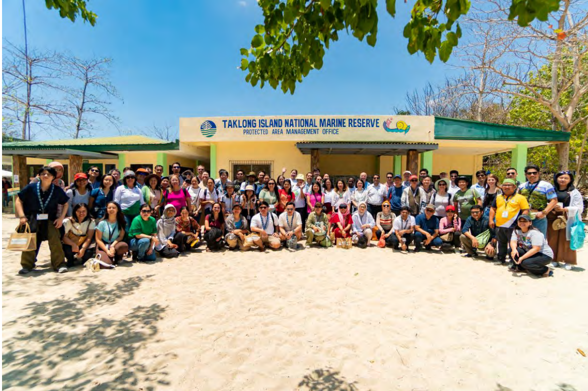
Group picture of field trip participants in Guimaras Island

In two engaging deep dive sessions, the focus shifted to the critical realms of "Behavioral Change" and "Extended Producer Responsibility (EPR)." The first session, dedicated to Behavioral Change, presented the Behavioral Change Design Toolbox for the first time. The toolbox is developed by 3RproMar to support the ASEAN Regional Action Plan for Combating Marine Debris in the ASEAN Member States. This session highlighted the importance of tailoring strategies to diverse communities and offered a live testing of elements of the toolbox.