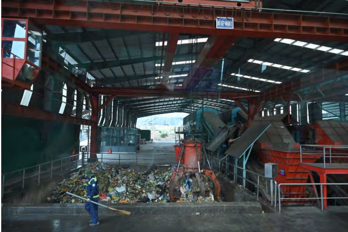
Stakeholder forum attendees toured Binh Duong Water – Environment Corporation’s plant and learned about its waste treatment methods and processes.

The collection rate in Tran De Town is about 89.1%, with the Soc Trang Public Works Company (SPWC) accounting for 73.8%, the informal waste collectors accounting for 15.3%, and the uncollected waste rate being 10.9%. The plastic waste generated is approximately 1.05 tons per day.