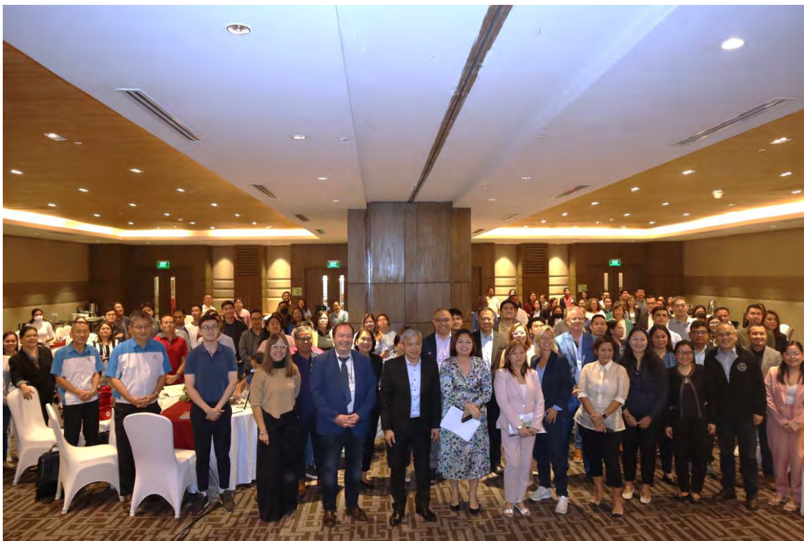
Participants at the 2nd National Stakeholder Forum of 3RproMar Philippines

Apart from the roundtable discussions on EPR, 3RproMar also supported the Speakers' Bureau Training held in Iloilo City hosted by the Environmental Management Bureau (EMB) Region 6 to support the EPR Law implementation.