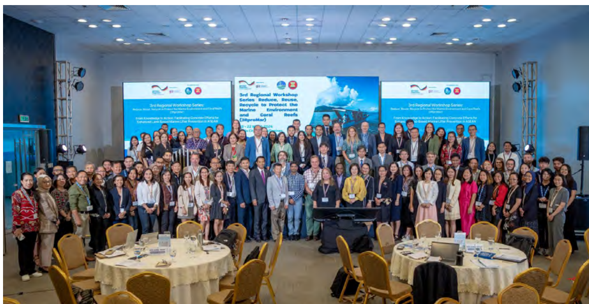
Participants of 3RproMar 3rd Regional Workshop