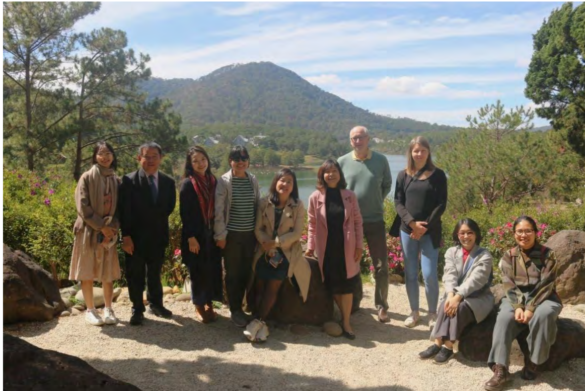
GIZ and partners learnt about sustainable tourism under Da Lat lush pine forests

On 29 January 2024, Da Lat City's People Committee, GIZ, and local experts joined hands to develop a preliminary Operational Plan for AMUSE's activities in the city throughout 2024. Da Lat City (Lam Dong province) – honored with the “ASEAN Clean Tourist City Award 2022” – was selected as the pilot site for the Vietnam AMUSE project. The pilot interventions in Da Lat aim to leverage the management of municipal waste and recycling, which faces significant drawbacks. The interactive workshop allowed GIZ and Da Lat partners to update on project progress until now and envision coming activities.