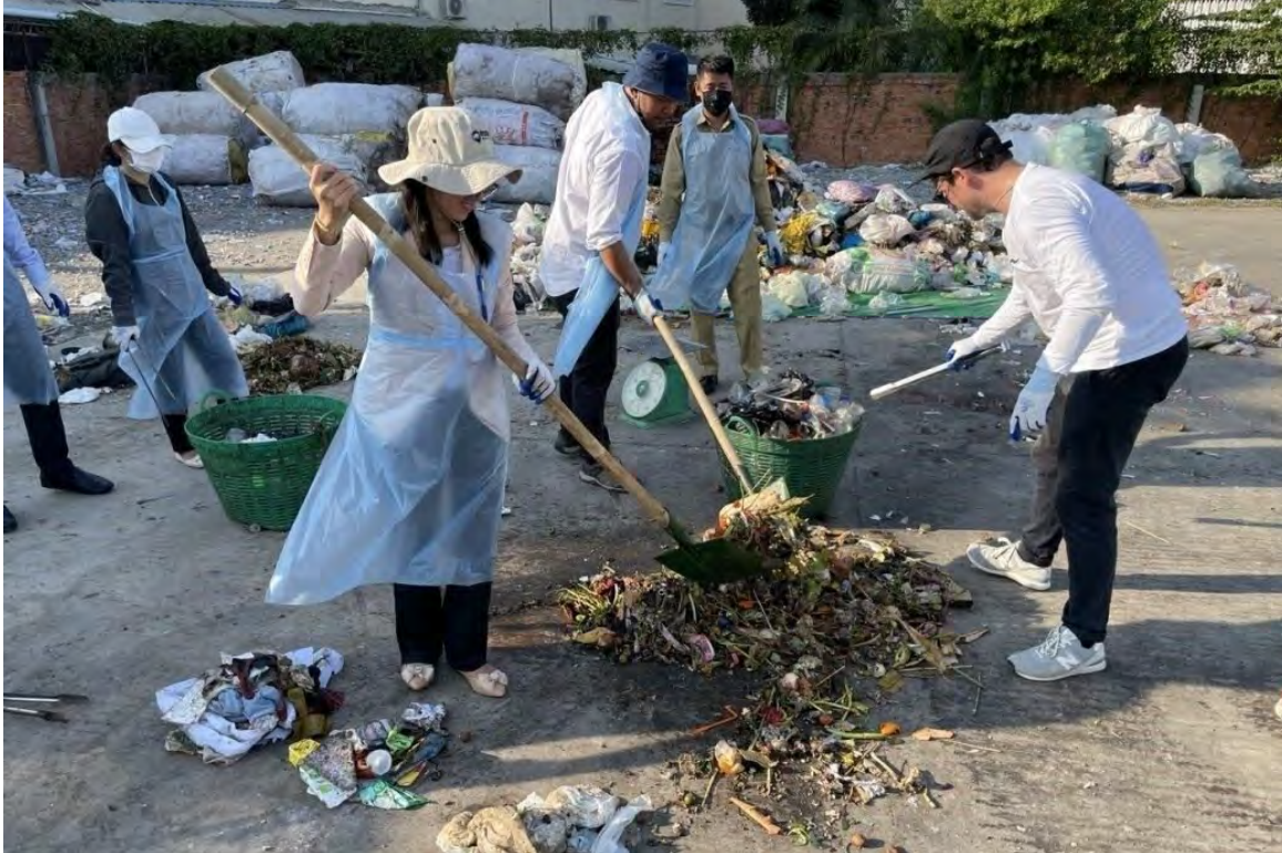
Training for better understanding of waste analysis theory, various approaches, and practical tools

On the 11th and 12th of December 2023, the Ministry of Environment (MoE) joined forces with GIZ under the 3RproMar project to organize a highly informative and impactful training workshop on Waste Analysis and Waste Flow Diagram. The event aimed to equip participants with a deeper understanding of waste analysis theory, various approaches, and practical tools.