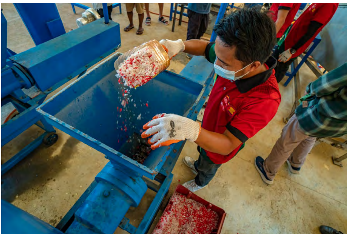
In Guimaras Island participants were able to visit pilot sites of 3RproMar

In two engaging deep dive sessions, the focus shifted to the critical realms of "Behavioral Change" and "Extended Producer Responsibility (EPR)." The first session, dedicated to Behavioral Change, presented the Behavioral Change Design Toolbox for the first time. The toolbox is developed by 3RproMar to support the ASEAN Regional Action Plan for Combating Marine Debris in the ASEAN Member States. This session highlighted the importance of tailoring strategies to diverse communities and offered a live testing of elements of the toolbox.