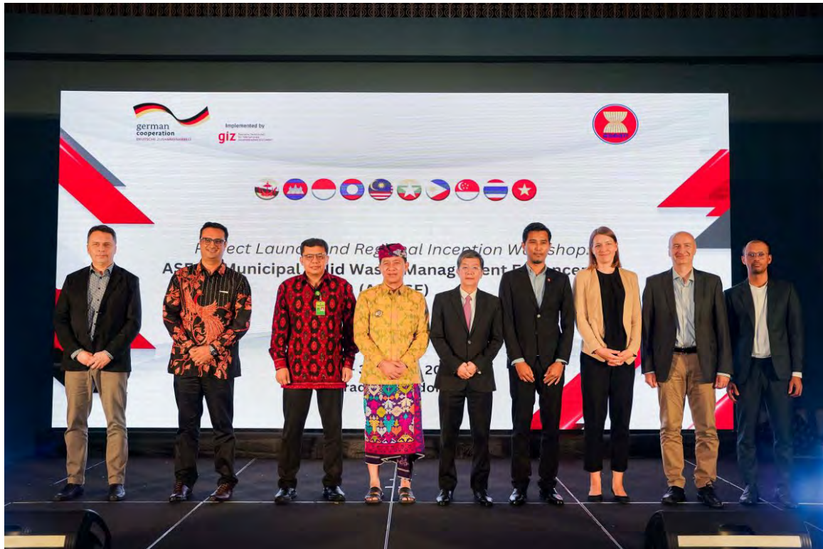
AMUSE Launching and Regional Inception Workshop