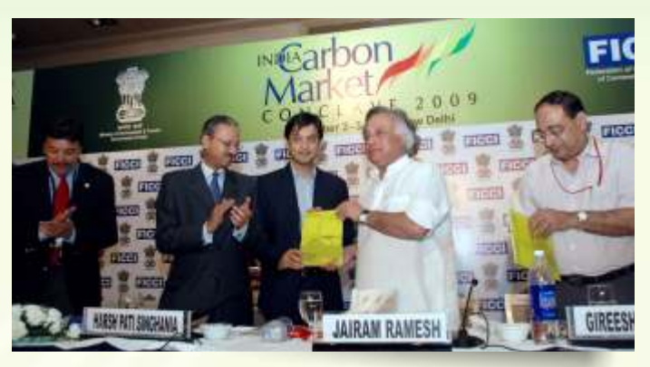
Mr Jairam Ramesh, Former Minister of State for Environment & Forests, Government of India at ICMC 2009