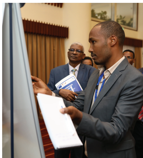
State and non-state actors are supported with workshops and training on migration-related issues.

BMM's implementation partners are cooperating with other relevant international initiatives such as EU-