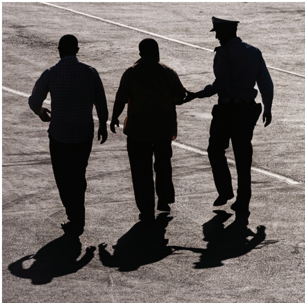
Law enforcement officials receive training to improve investigation and prosecution of human trafficking cases.

The programme continues to support the Ministry of Foreign Affairs and the Ministry of Justice in implementing the UNTOC Protocol against the