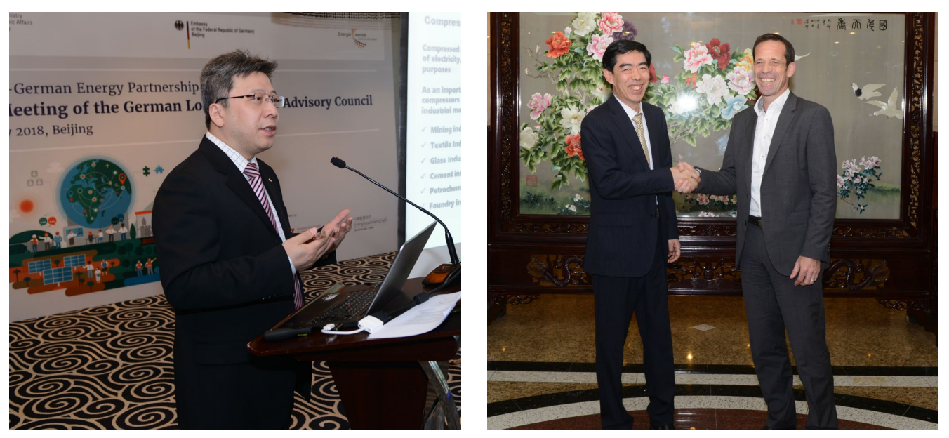
Industry representatives discussing the Chinese market's potentials at the business council's inaugural meeting