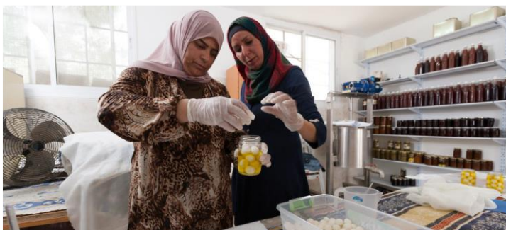
Women Cooperative in Gaza 2019

While the MNE is the programme’s political partner, PSDP cooperates with a number of business service providers and sector associations in the four target sectors, e.g. the Palestinian Information Technology Association, the Palestinian Food Industry Union, Bethlehem Fair Trade Artisans (BFTA), and Holy Land Incoming Tour Operators Association (HLITOA).