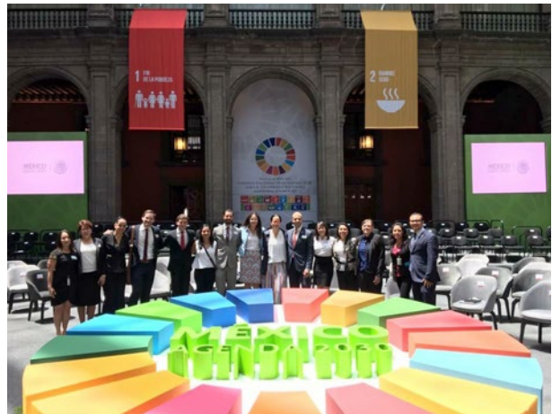
Representatives of the Office of the Mexican President and the team of the 2030 Agenda Initiative at the implementation of the National Council in the Governmental Palace in Mexico-City.

The project supports effective coordination of the government's framework for implementing the 2030 Agenda.