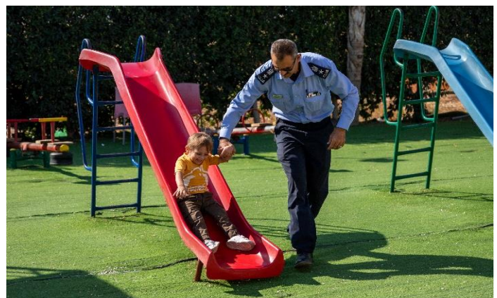
Police officer during outreach activity in a public park, Jenin, 2019